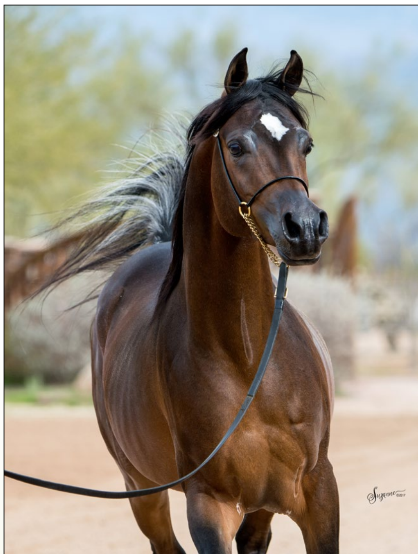
Qaysar Al Jood (Alixir x Rhapsody in Black) 2013 bay straight Egyptian stallion