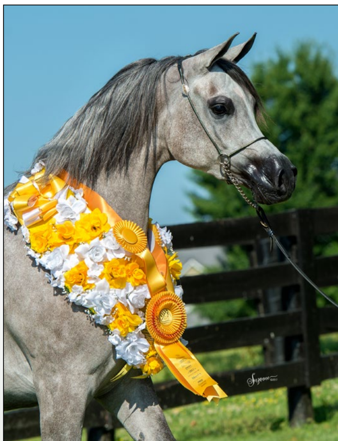
Maraam Al Jood (Marajb KA x RSL Faith by Alixir) 2014 grey straight Egyptian mare