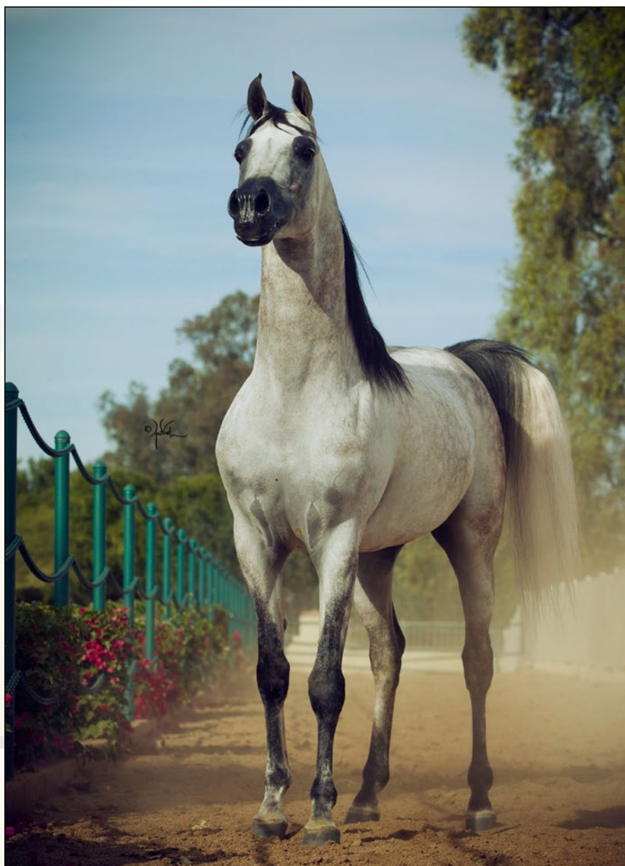
Destyned Valentino (DA Valentino x Fabrices Destiny) 2009 purebred stallion