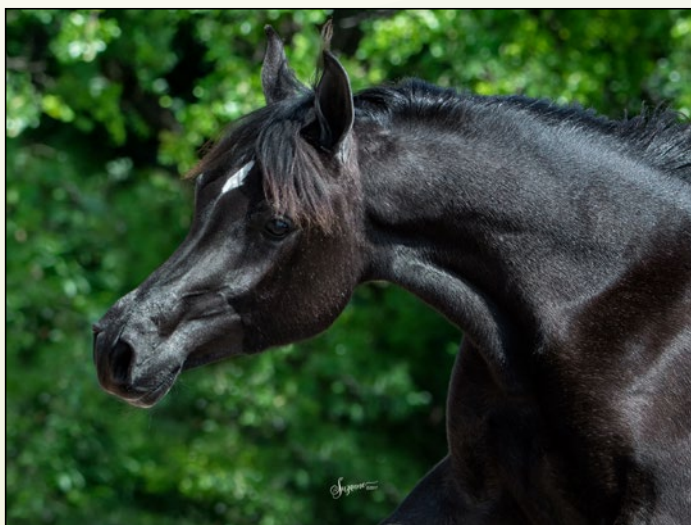
Farah Al Jood (Alixir x Fariha Magidaa) 2016 black straight Egyptian filly