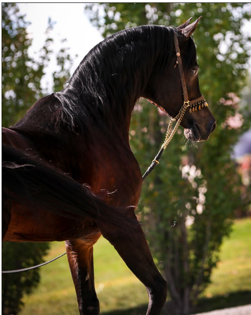
Alixir (The Elixir x The Prevue) 1998 bay straight Egyptian stallion