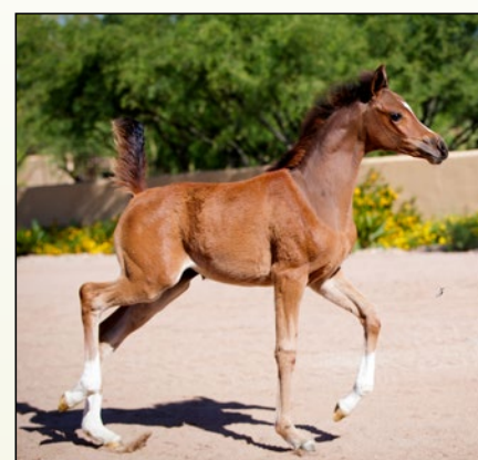
AJS Johara El Malik (Malik El Jamaal x La Dolce Jullye) 2 017 purebred filly