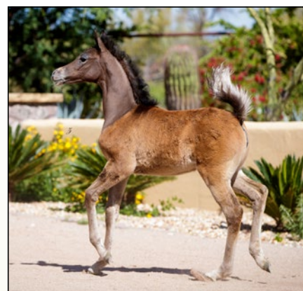
AJS Khamelia El Malik (Malik El Jamaal x Khaleesi SWF) 2017 purebred filly