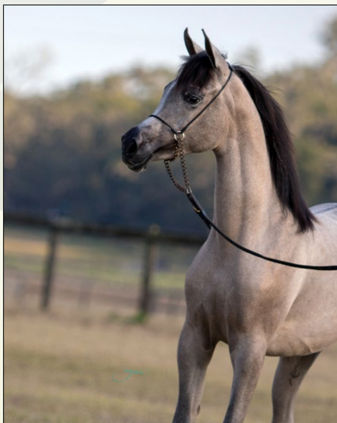
AJS Sigi's Belle (Marajb KA x Om El Badra) 2017 grey purebred filly