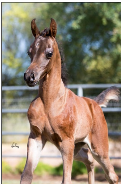
2017 colt (D Angelo x DD Crown Jewel). Bred and owned by Gemini Acres