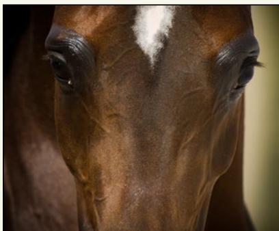
D Angelo (JJ Bellagio x Dark Angel GA) 2014 bay purebred stallion