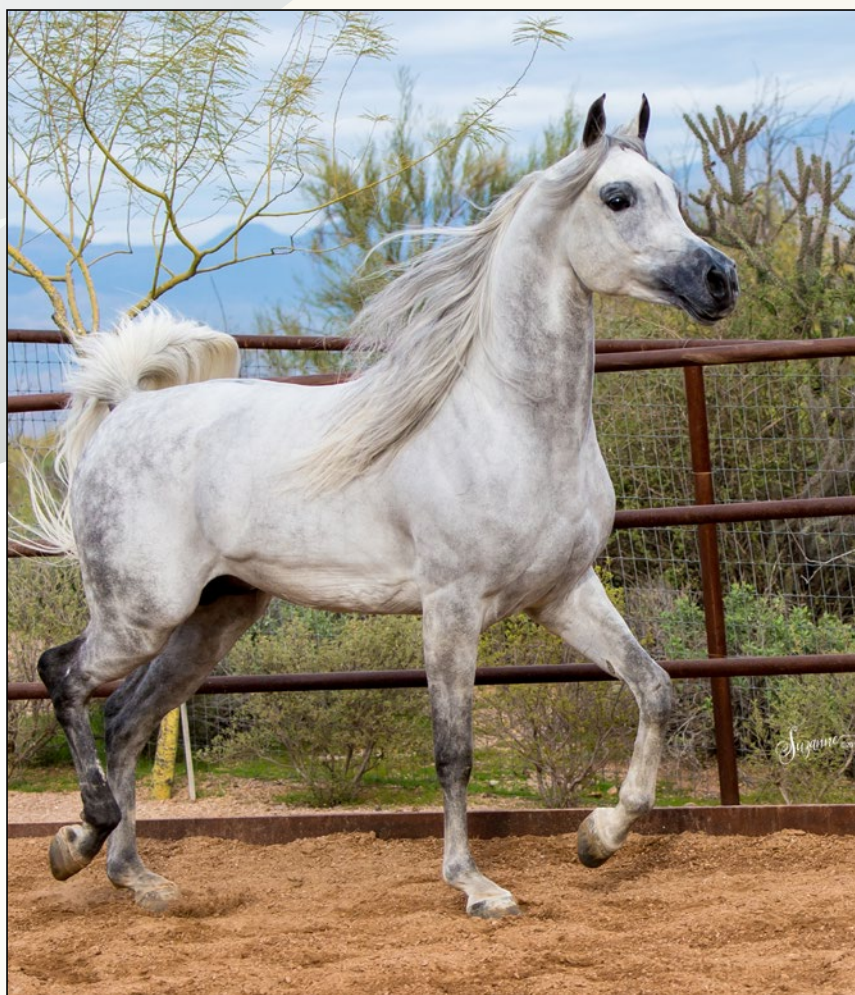
Malik El Jamaal (Ludjin El Jamaal x Pinga) 2010 grey purebred stallion