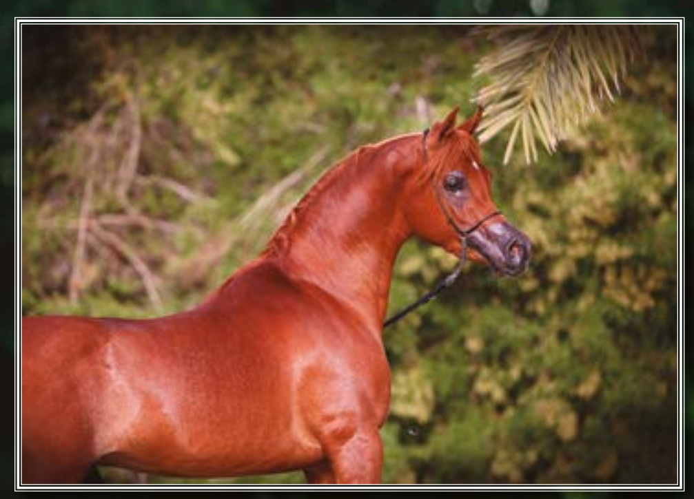
Dhahab Al Danat SINAN AL RAYYAN X MUZHELA