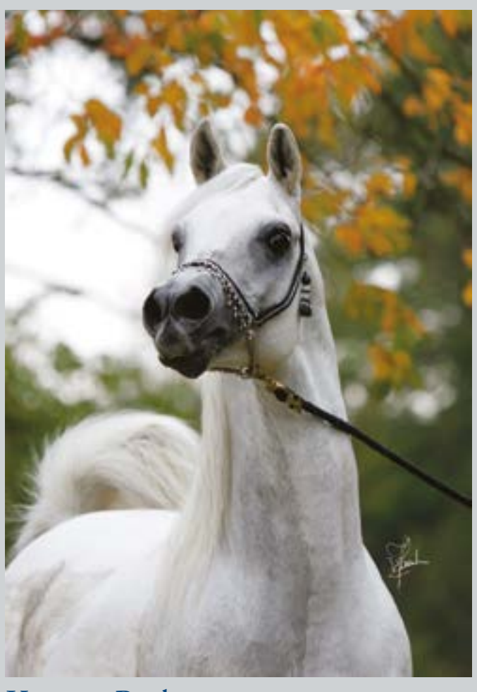
Kamsin Rodan ANSATA SINAN x KHEVIVA RODANIYAH Multiple Show Champion