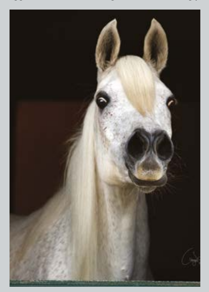
Khediva Rodaniyah ROOTMARE