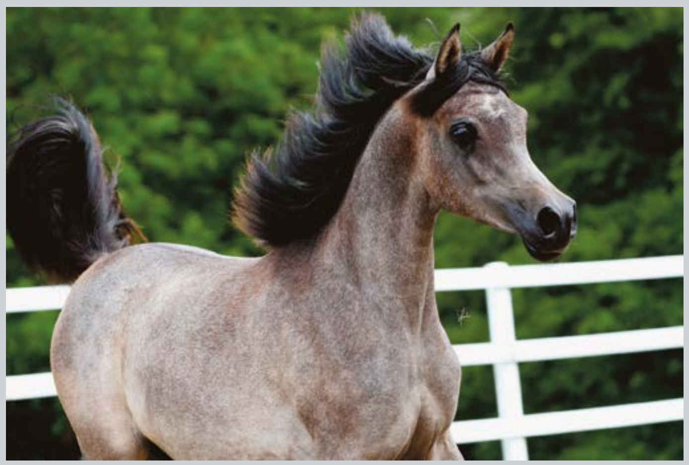
Amoun Sherifah amoun halima x shamekh al danat