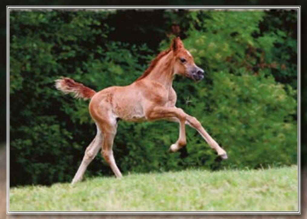
Amoun Madiah dhahab al danat x amoun malika