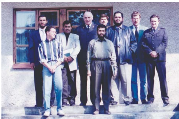
MICHAŁÓW STATE STUD, POLAND, 1994