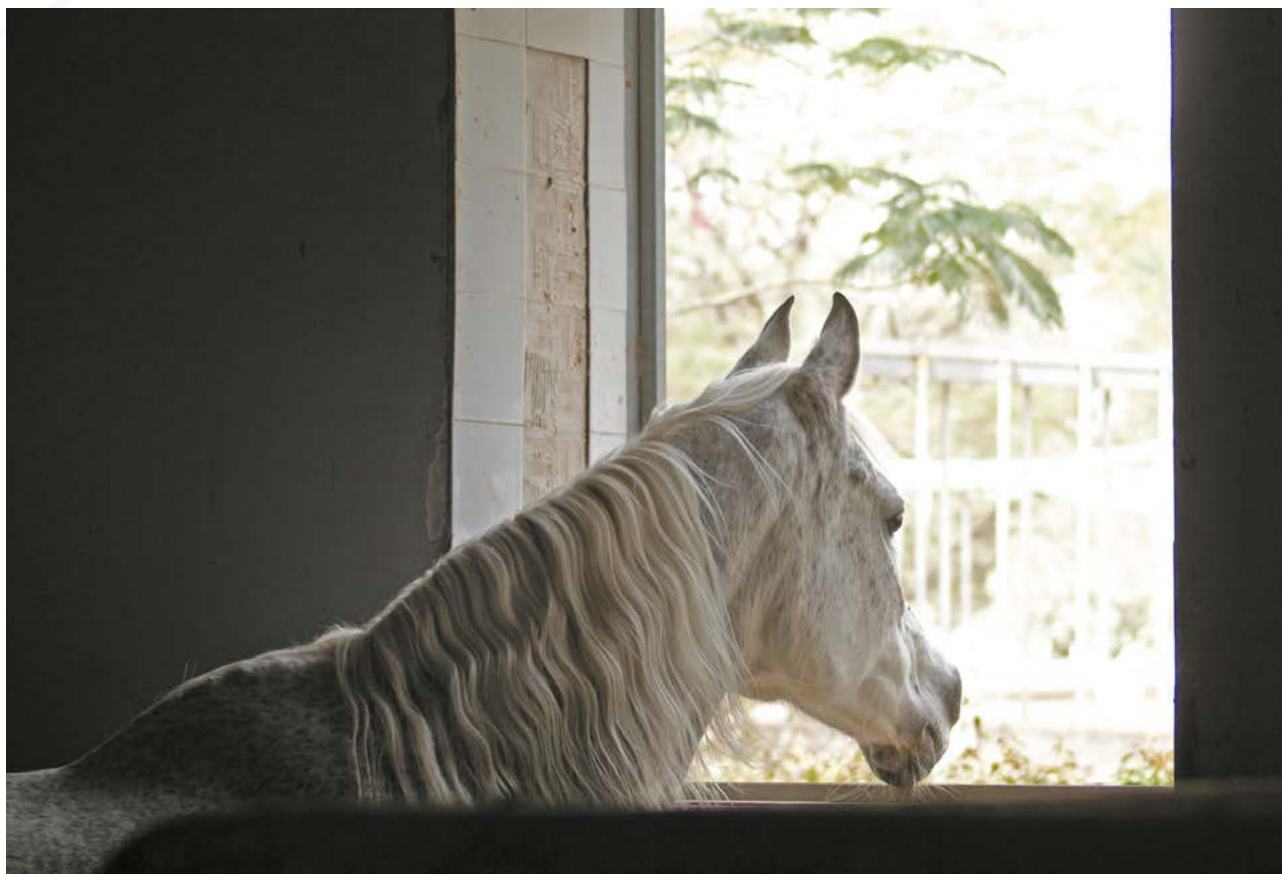
SAFI R AL RAYYAN (ASHHAL AL RAYYAN - RN FARIDA), AL RAYYAN FARM 2015