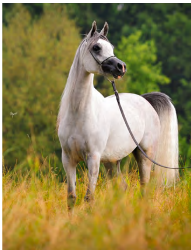
ENIDA J (Royal Asad x Elgazonda).

(by Pegaz) and Mysterious Lady J (by Ekstern) carried forward her legacy with elegance and strength. Through Starlight came Mauhiba J (by Ekstern), a two-time National Champion in Saudi Arabia and one of Jadem's most influential broodmares. Mauhiba produced Magnificent Lady J (by Extreme), dam of major winners like Mississippi J (by QR Marc), Morgan J, and Merida J (both by Emerald J), all of whom have won prestigious titles across Europe.