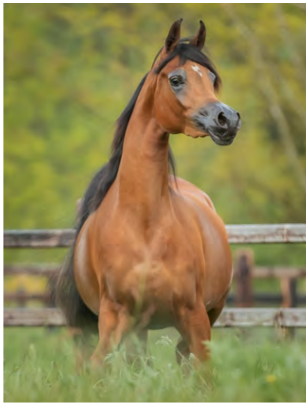
NOORA J (Emerald J x Noft Al Nayfat).