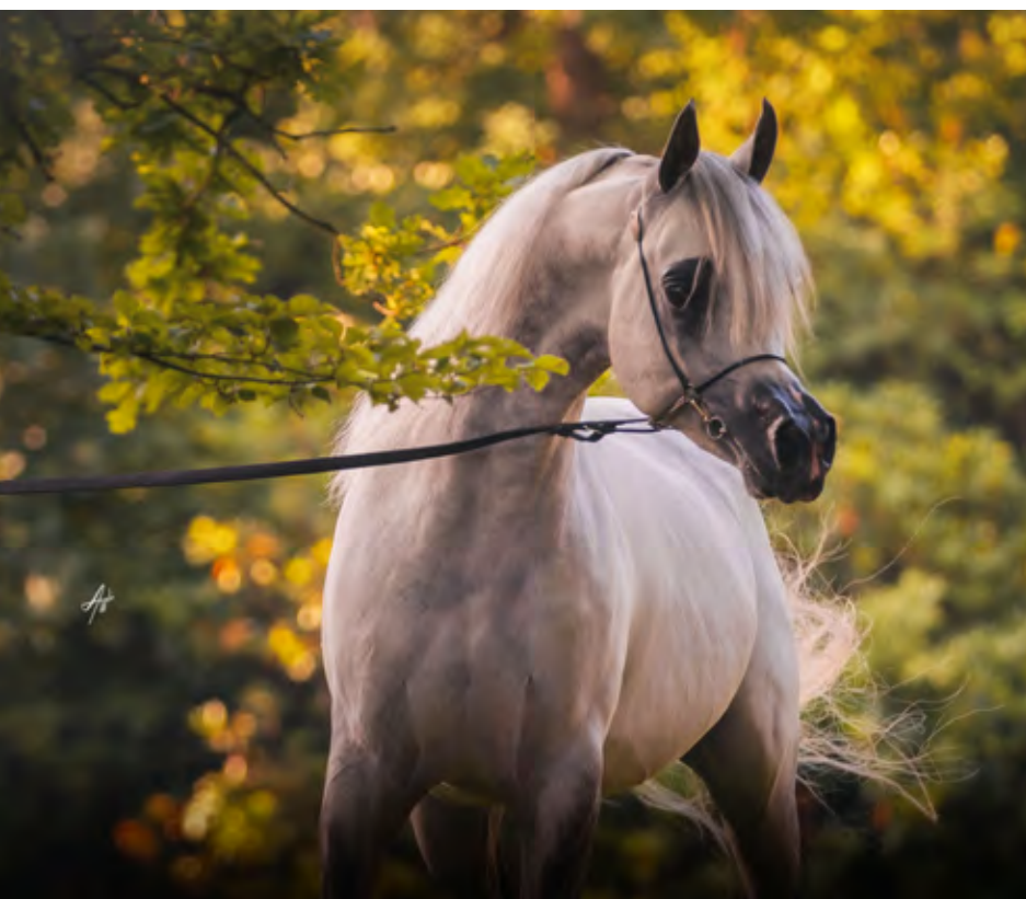
MURANAS NADER (Emerald J x Muranas Nabila).