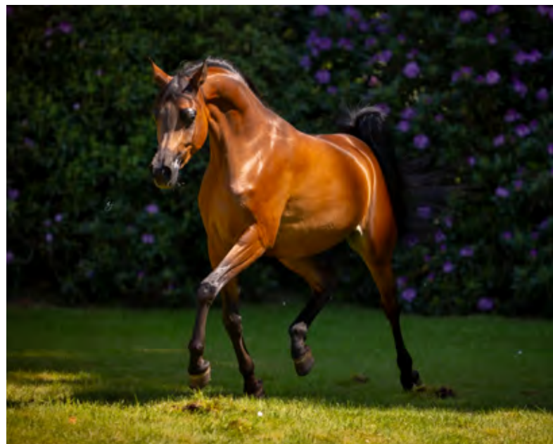
MOUNA J (Morion x Mississippi J).