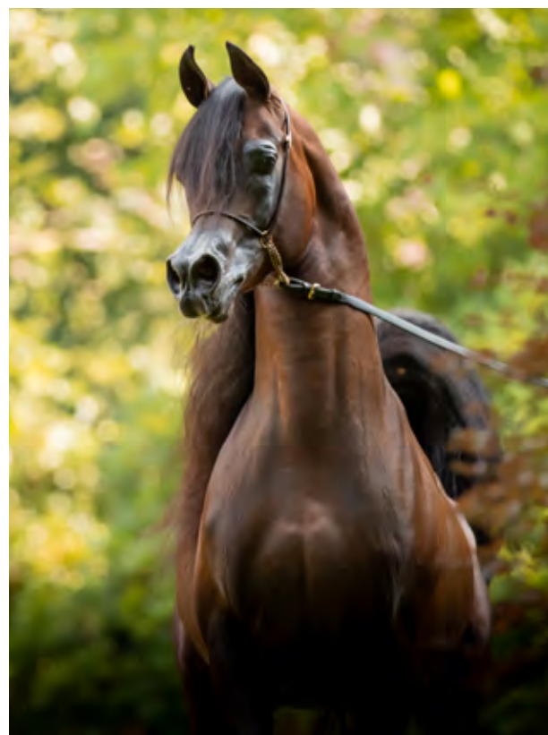
EMERALD J.

At the 2021 Katara International Arabian Horse Festival in Qatar, Muranas Nader emerged as Gold Champion