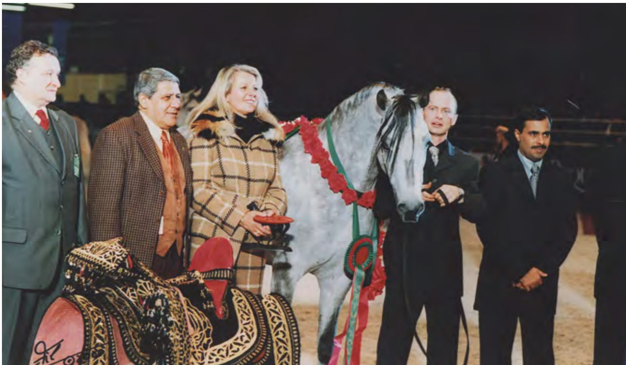
EKSTERN World Champion Stallion, Paris 2000.