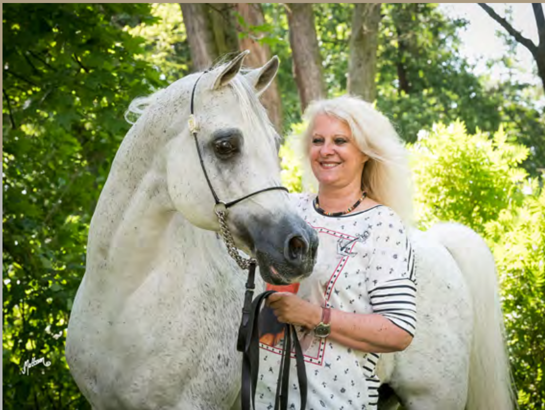
EKSTERN (Monogramm x Ernestyna)