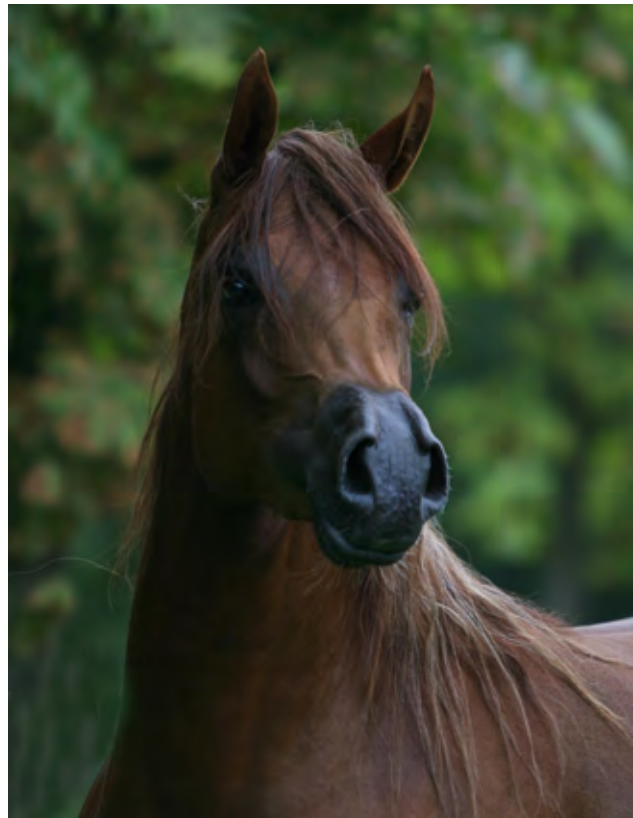
GOMERA J (Ekstern x Georgia)