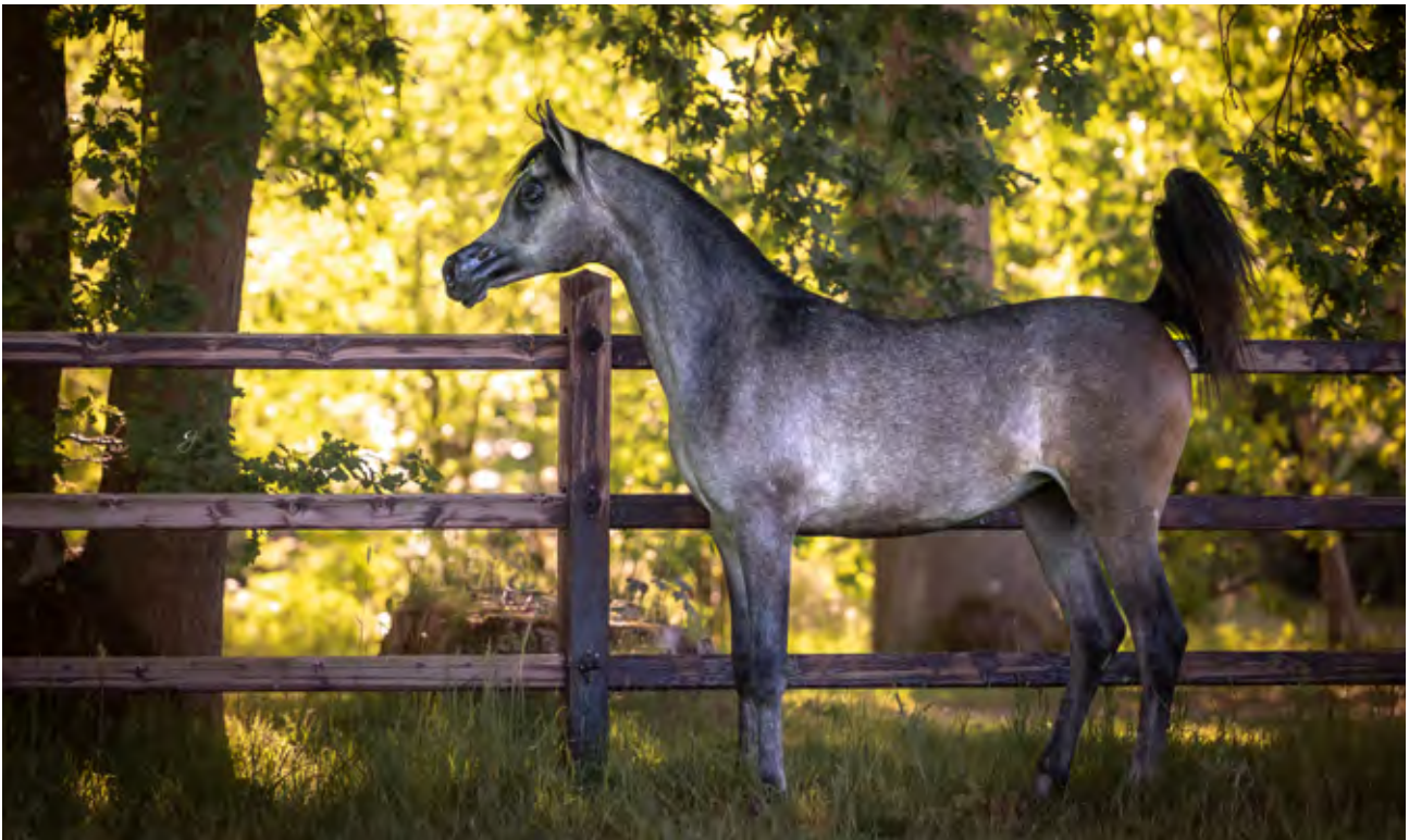
MAJIDAH J (Muranas Nader x Moana J).