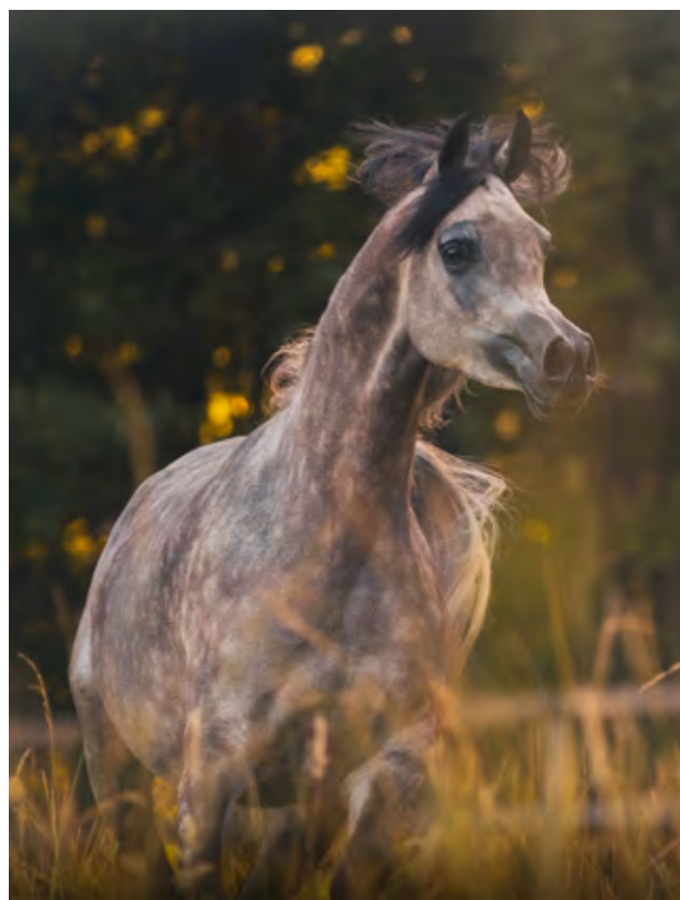
MABROUKA J (Morion x Miami J).

into one of Europe's most respected private Arabian breeding programmes - built not on trends or luck, but on the enduring pillars of passion, perseverance, and profound respect for the Arabian horse. Today, Jadem Arabians is a beacon in European breeding. With approximately 65 horses and an annual foal crop of over twenty, the farm is among the largest private Arabian operations on the continent. And yet, every decision, every pairing, every birth, is guided by an almost sacred commitment to quality.