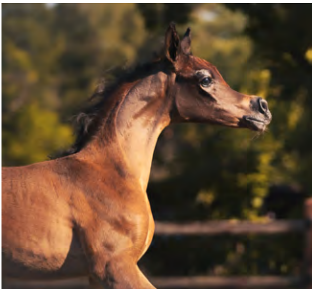
NAHLAH J (D Seraj x Noora J).