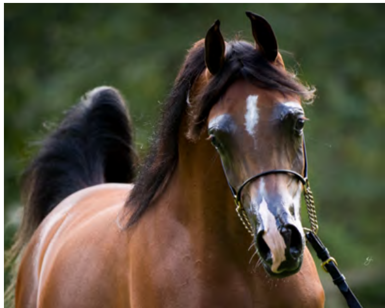
MADAGASCAR J (Excalibur EA x Mississippi J).