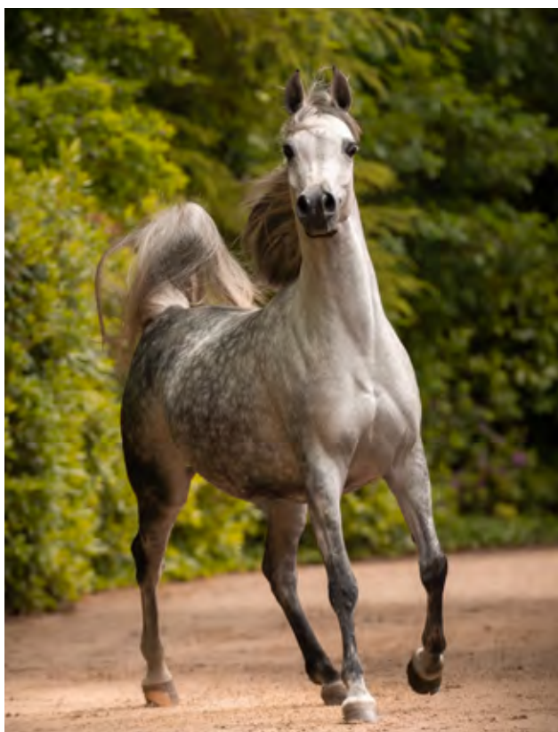
DALIA J (Emerald J x Danuta).