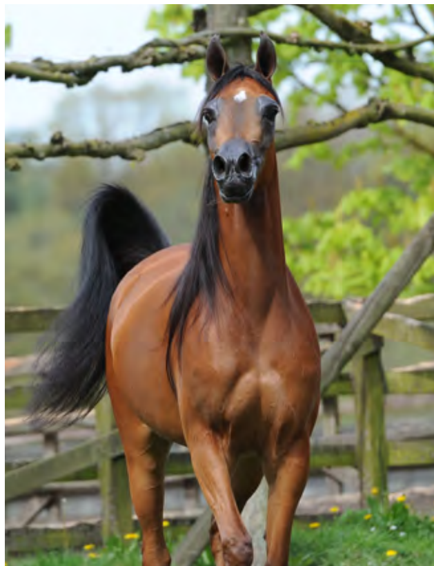
PARIS J (Emerald J x Palabra).

The line of Mysterious Lady J, a daughter of Ekstern out of Morning Light VF, also continues to thrive. Her daughter Maja J (by Extreme) is the dam of Melody J (by Emerald J), a multiple European medallist, and Montana J (by Shiraz de Lafon), 2019 AHO Gold