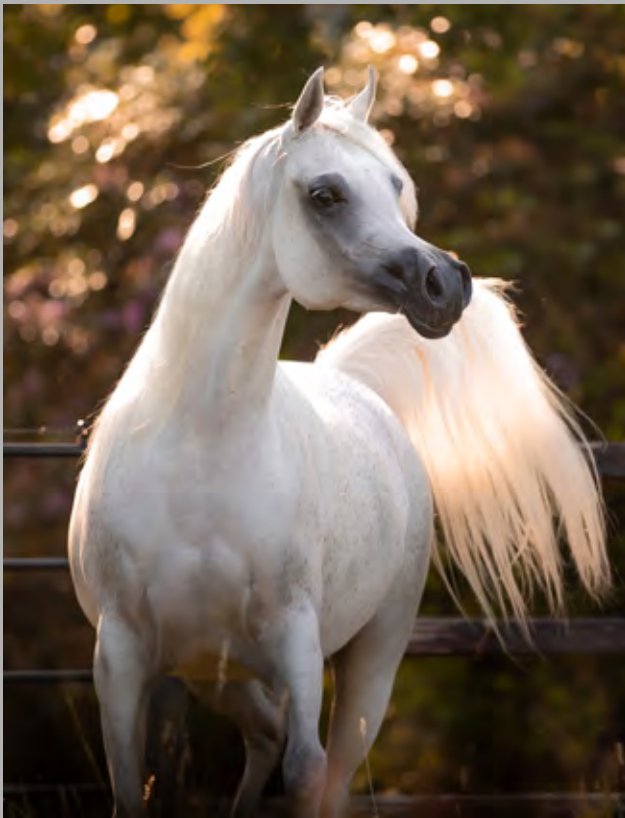
MARRAKECH J (Emerald J x Ja Ultima).