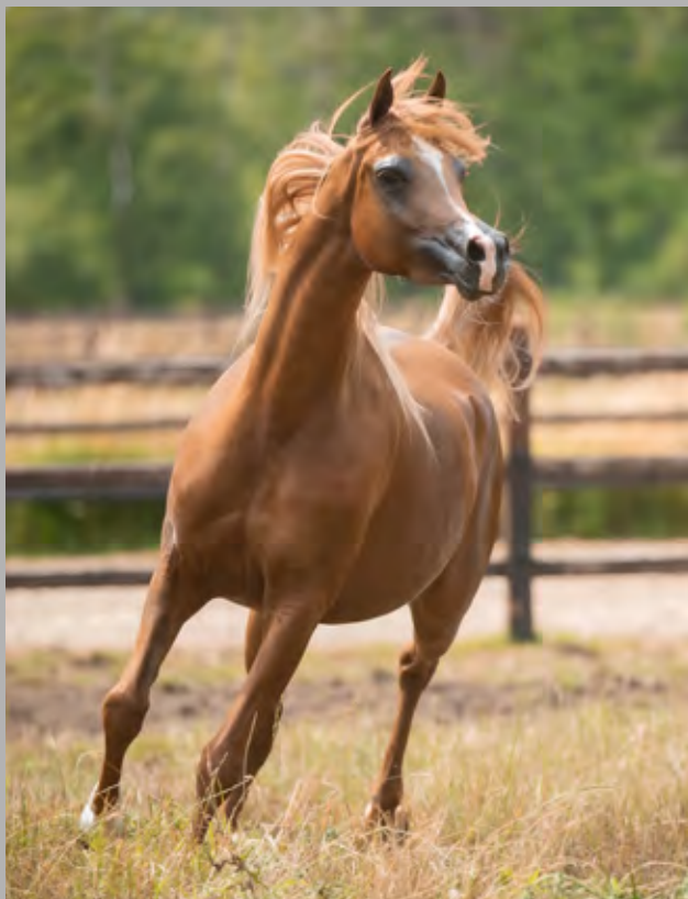
MELILLA HVP (Thee Apprentice x Tawani HVP).