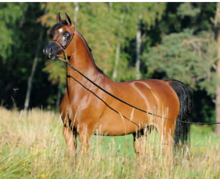
MISSISSIPPI J (Qr Marc x Magnificent Lady J).