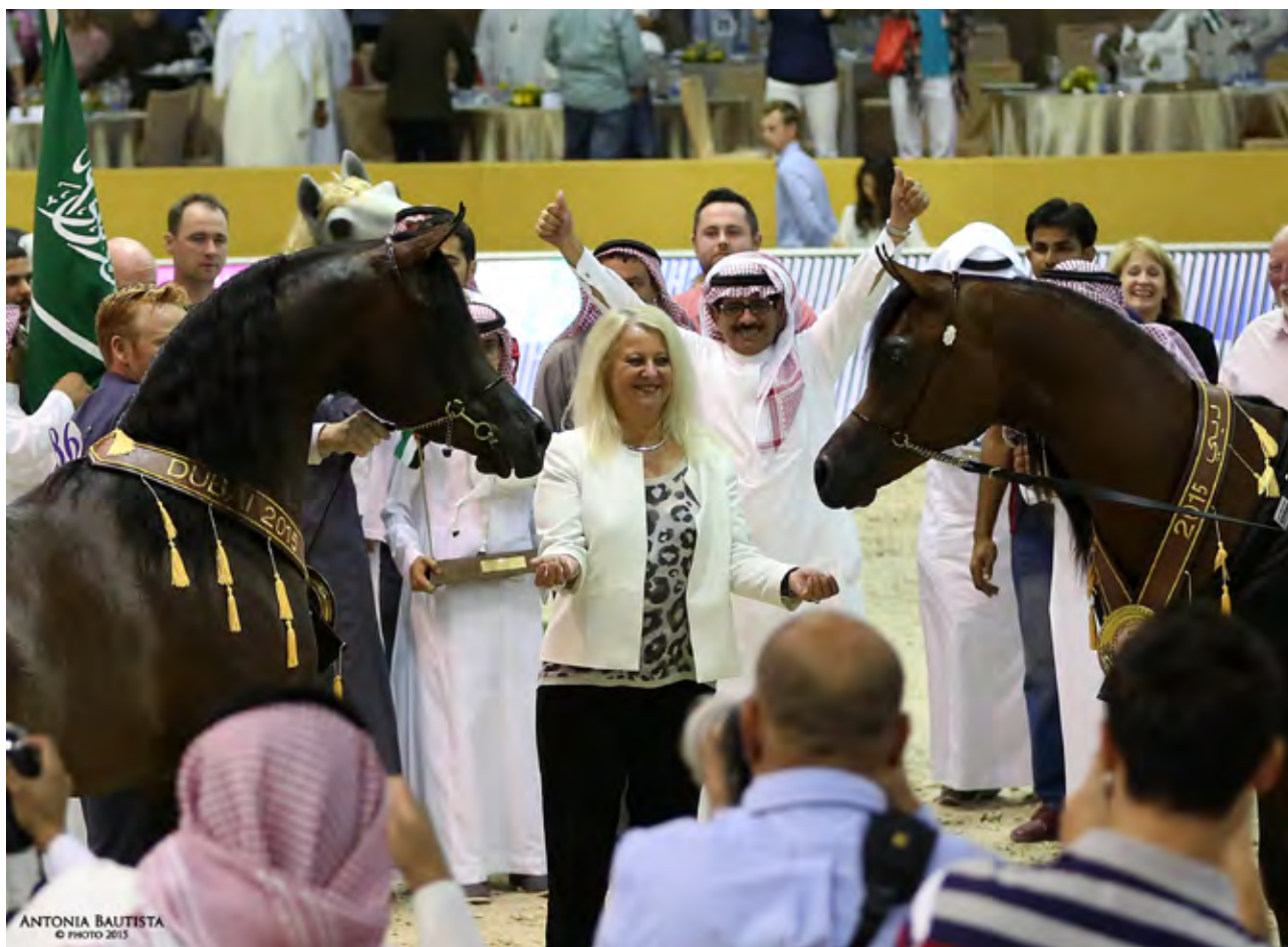
EMERALD J (QR Marc x Emandoria) and GALLARDO J (Emerald J x Gomera J) both Gold Champions, Dubai 2015