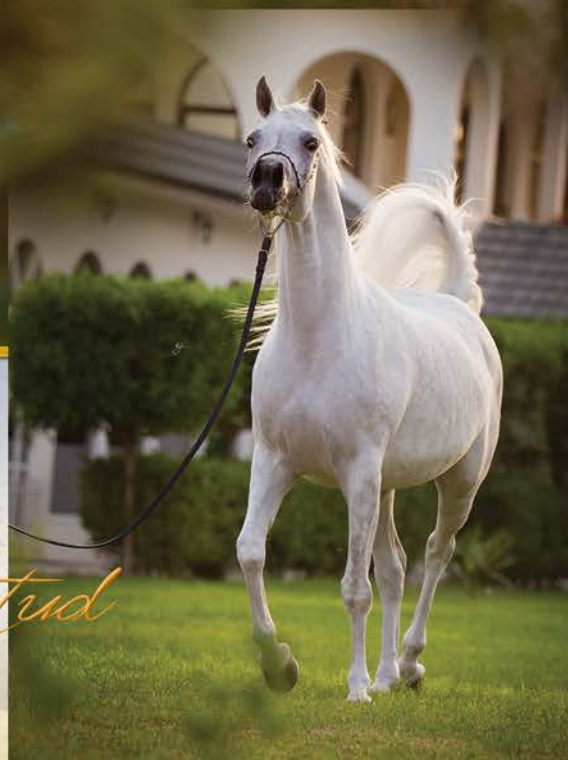
MIYYASA AL NAIF Ashhal Al Rayyan | Adal Al Naif by Ansata Nile Echo