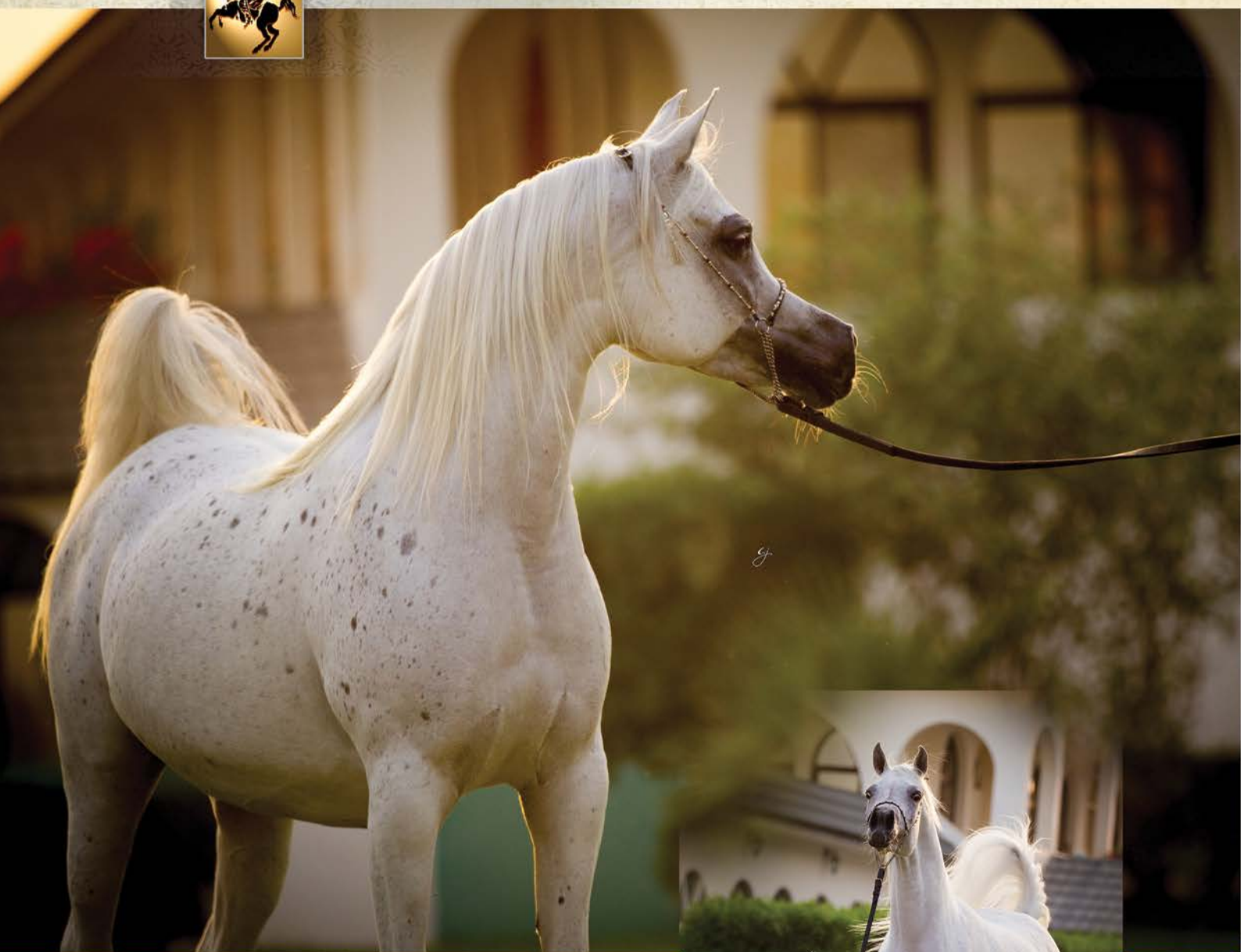
TOYA AL NAIF Al Adeed Al Shaqab | Simeon Seate