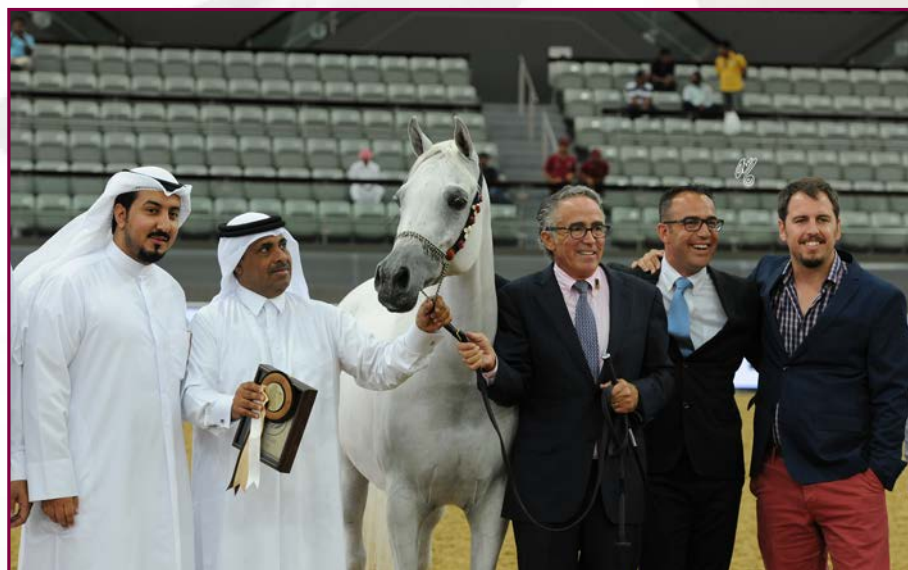
Great win Darine Al Rayyan (Ashhal Al Rayyan X Aisha)

"My earliest thoughts in life were about horses," he would tell you. He remembers his first experience riding was "about 7 years old" and it was "Bedouin style" (i.e.