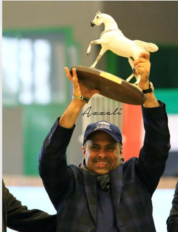
Sheik Hamad in Milan

And yet, the story is far from finished. He has been hard at work, putting together a legendary team of people to bring Al Shaqab into the limelight of its next glorious chapter.