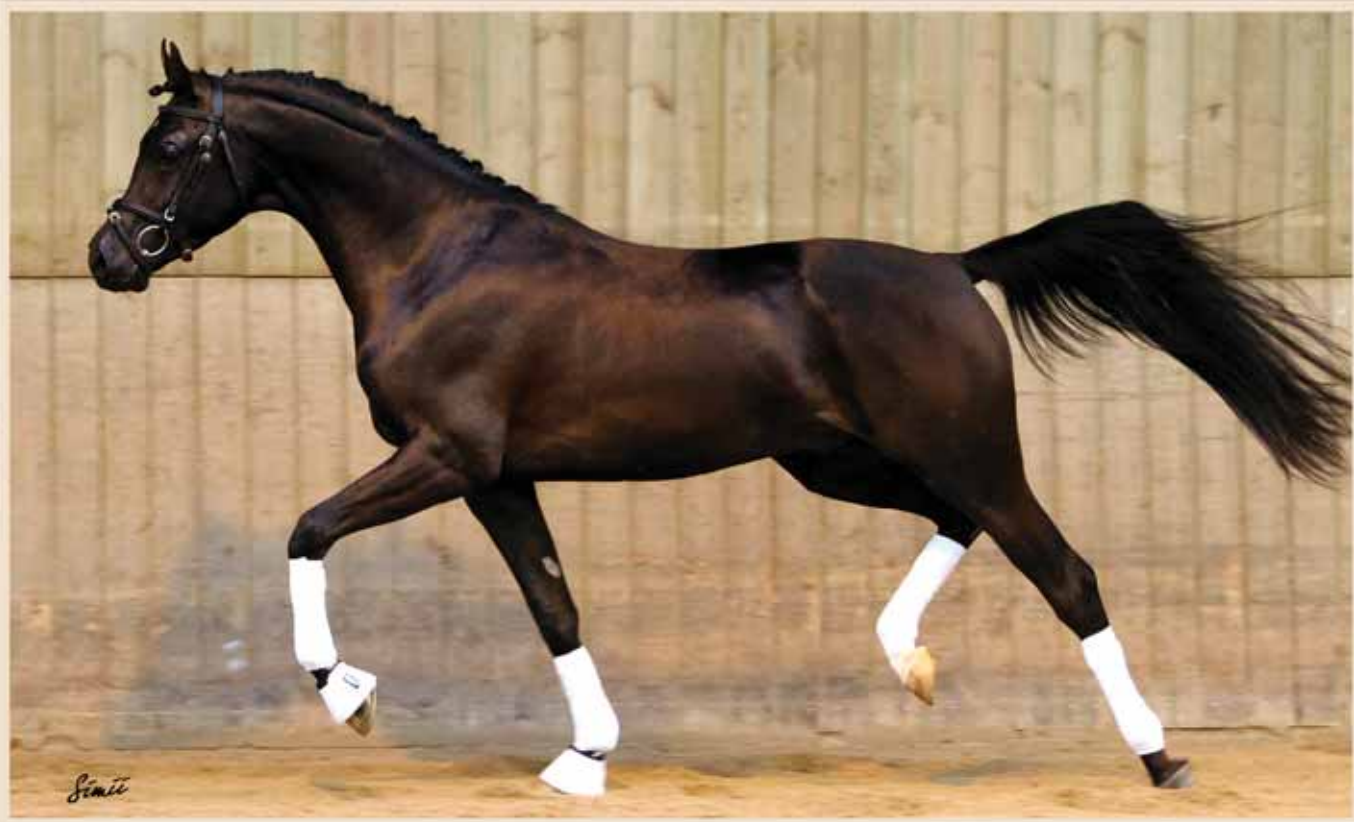
Champion Stallion Zonyx (Enzo x Balihs Treasure) Owner: Kirk Arabians