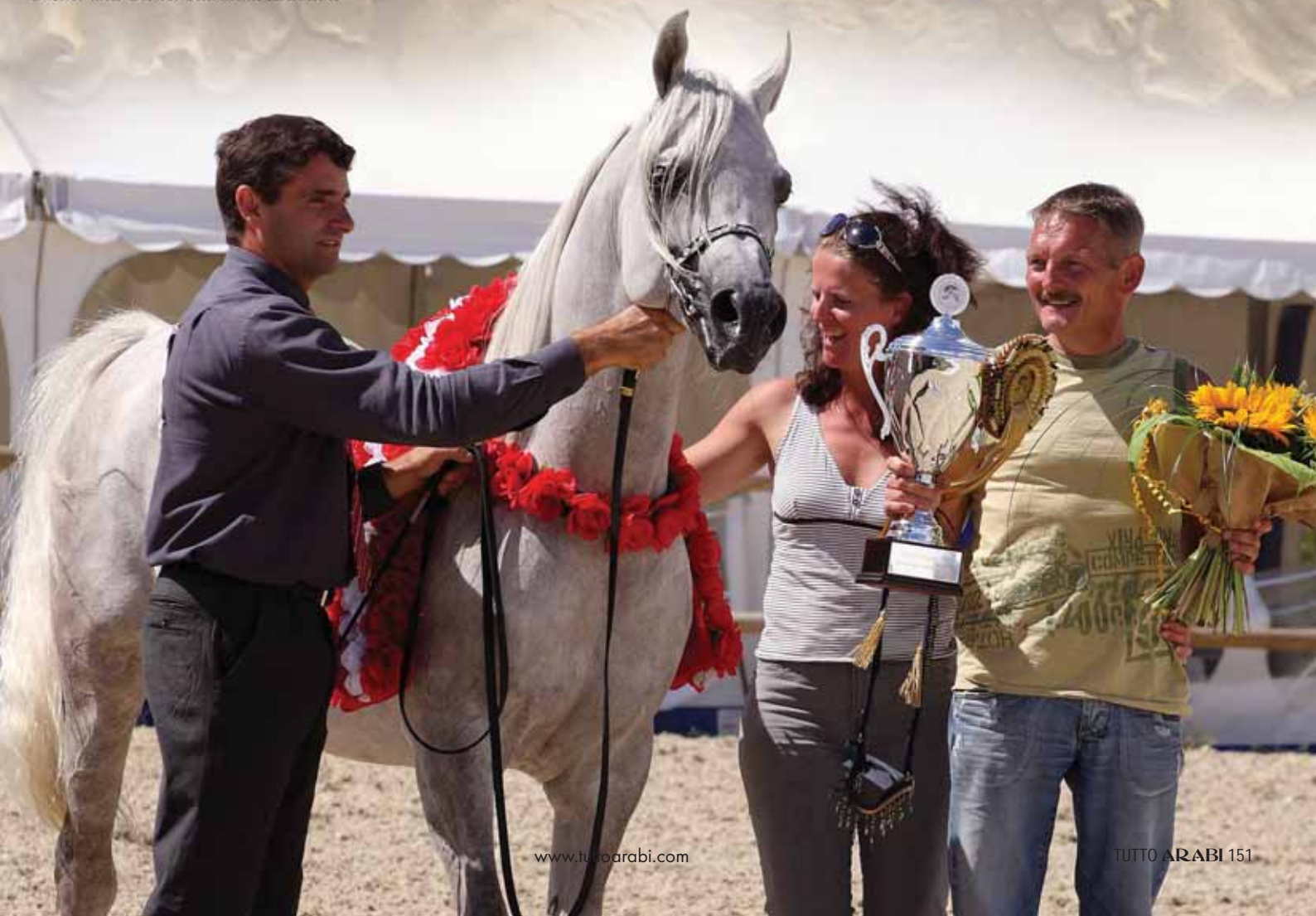
Multi Champion Stallion Azraff El Karmdal (Wisdoms Promise x Wanannah) Breder and Owner Karmdal Arabians