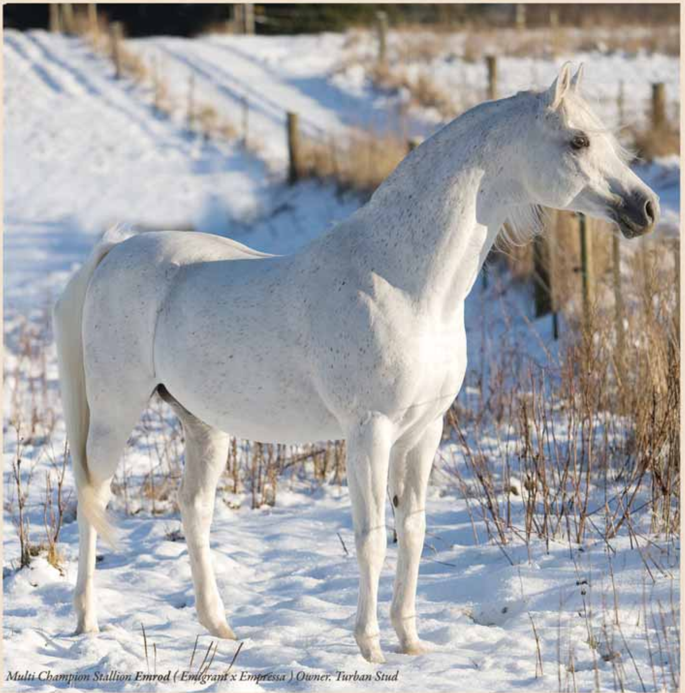
Multi Champion Stallion Emrod ( Emigrant x Empréssa ) Owner, Turban Stud