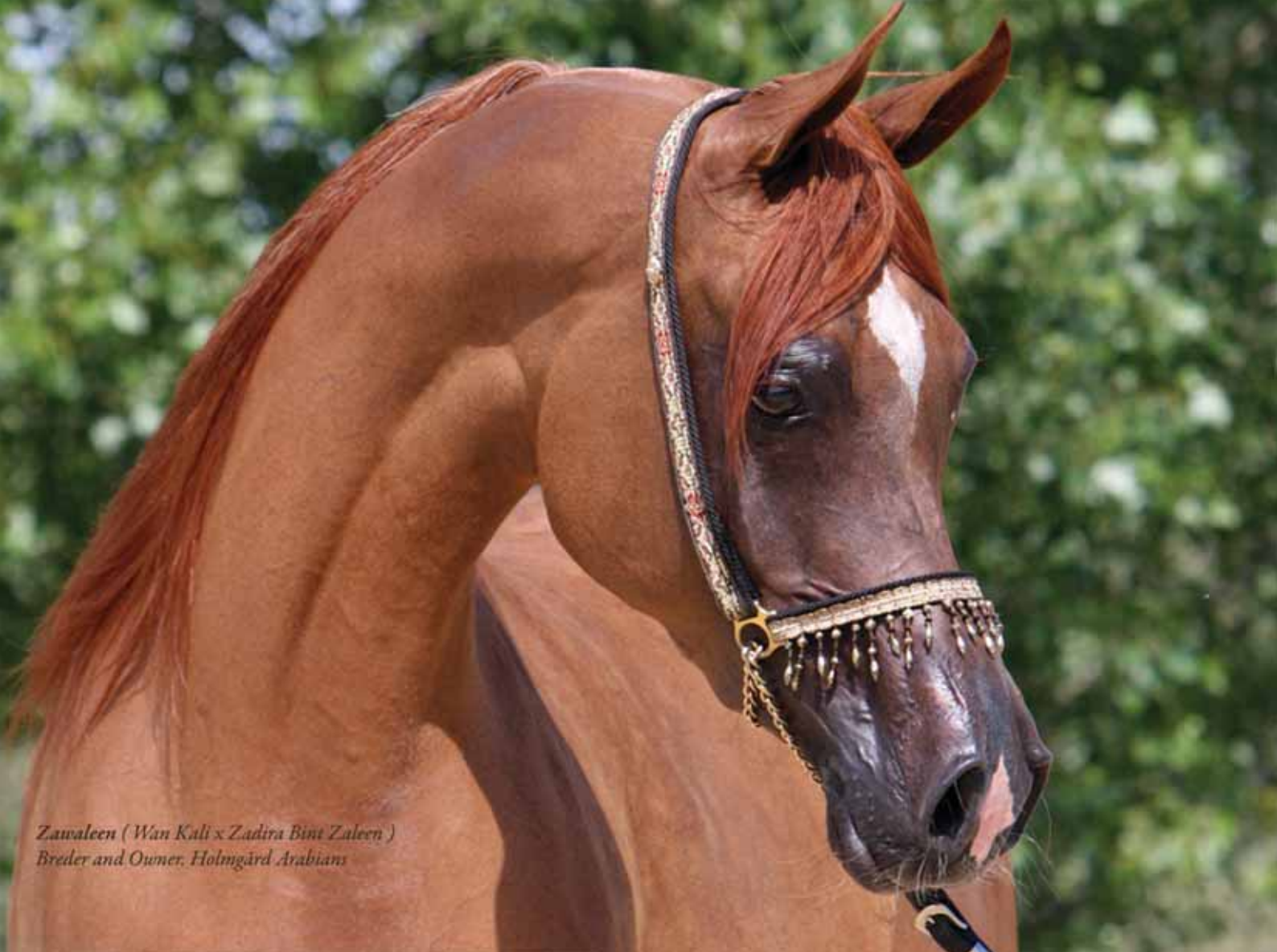
Zawaleen ( Wan Kali x Zadira Bint Zaleen ) Breder and Owner. Holmgård Arabians