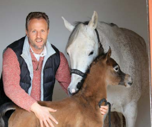
Rebecca Marc, filly 2012