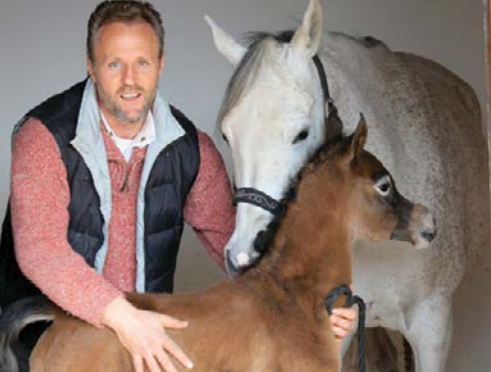
Stig Ashirafa, filly 2010 sold to Arabian Stud Europe