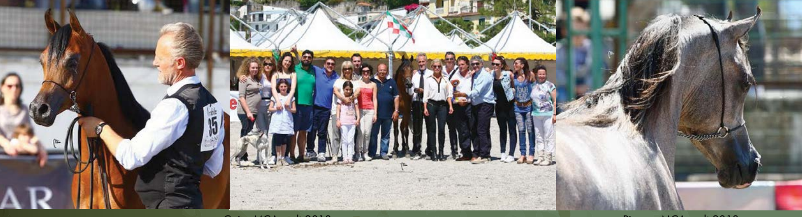
Cairo MCA, colt 2013