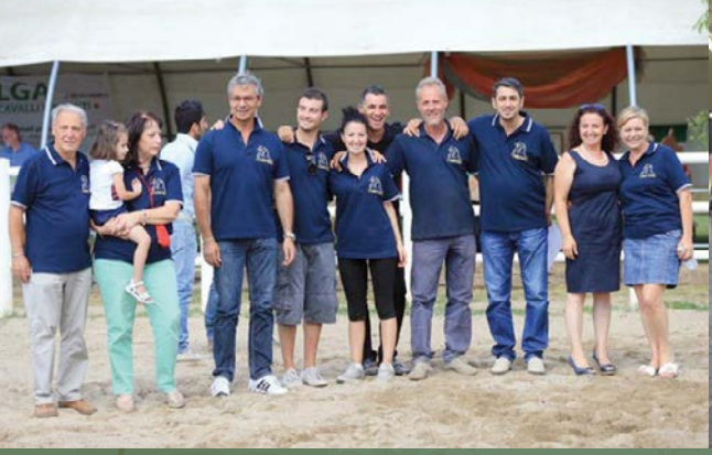
Open Day at Il Paradiso Arabians