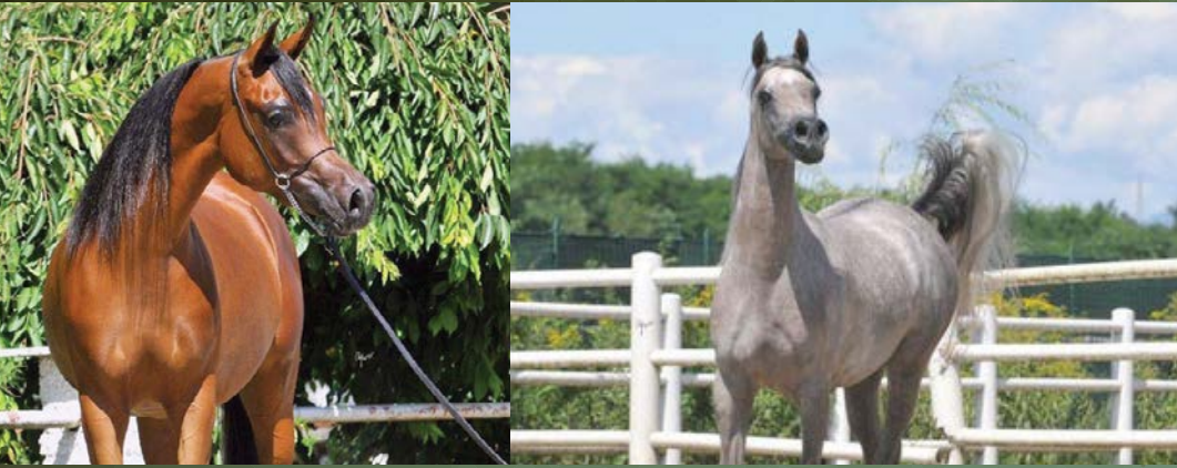
Divina by Sajida, mare 2009