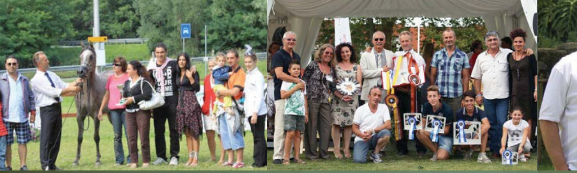
Najaa Ashiraf, mare 2008