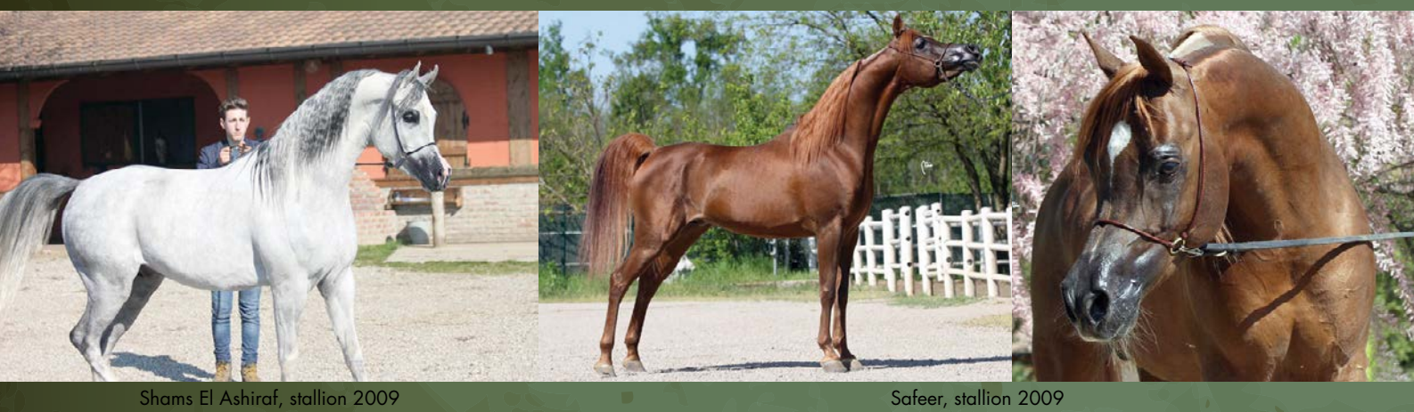
Situlis Li Asilitui, sidiloit 2007