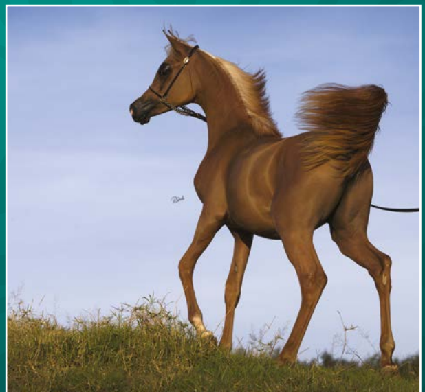
Jymarawa Meia Lua Marwan Al Shaqab | Jyvara El Maktub Filly, 2015