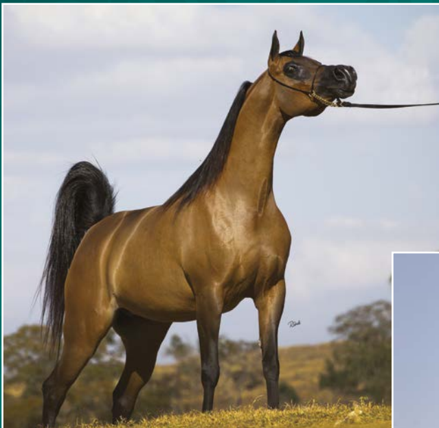
MG Magnolia Marwan Al Shaqab | MPA Psynata Mare, 2007