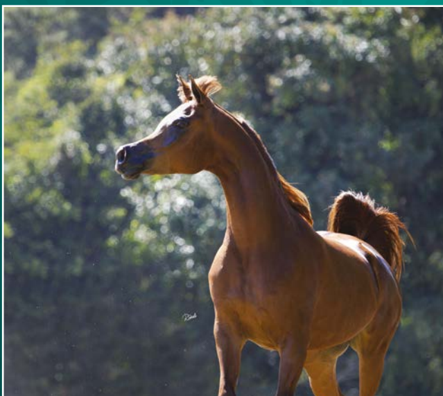
Muranas Mabrouka Marwan Al Shaqab | Mamuschka El Assuad Mare, 2010