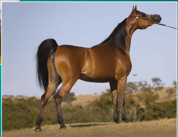
Brasilia LA Marwan Al Shaqab | Turchiya MPE Filly, 2014