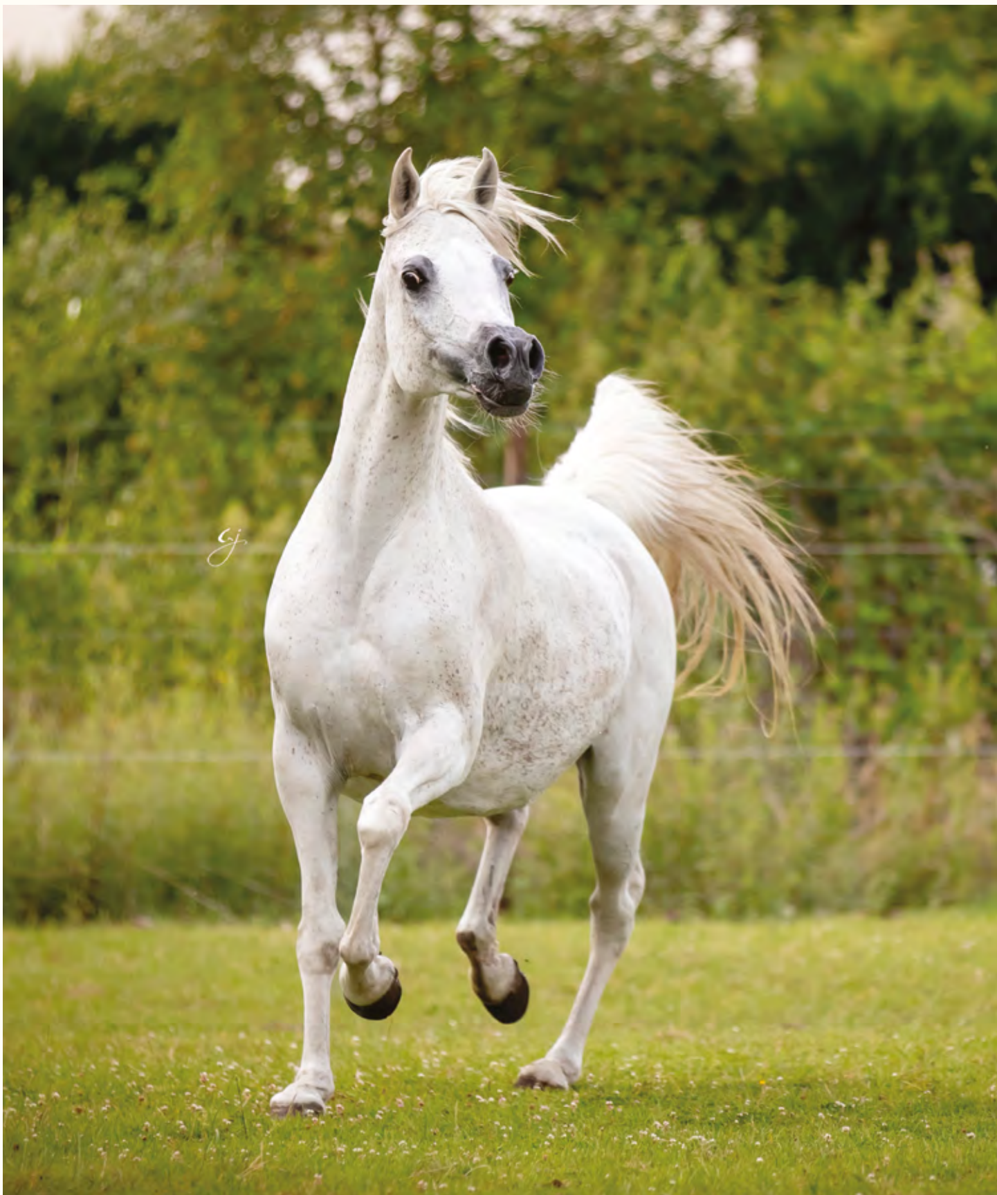
SERENE ISIS (Ibn Nejdy x Serene Carima by Salaa El Dine)