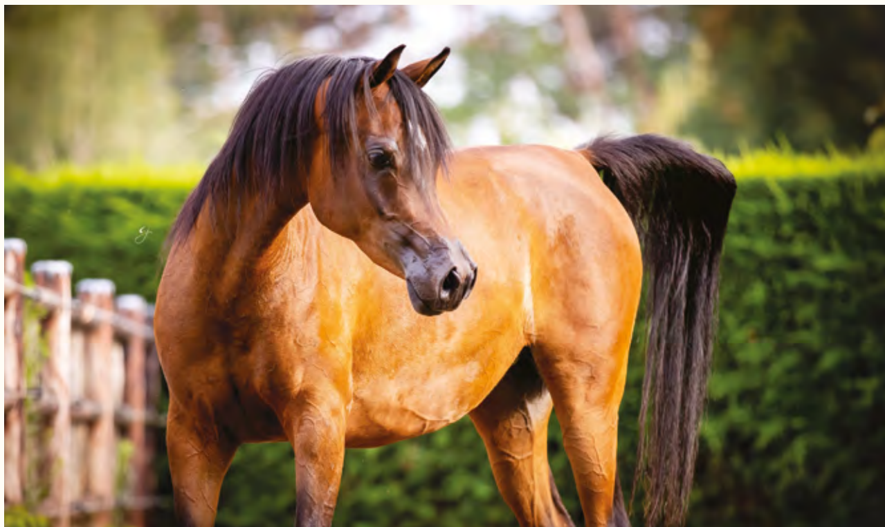
GJ AMIRA DEENAA (Naseem Al Rashediah x Pashmina)