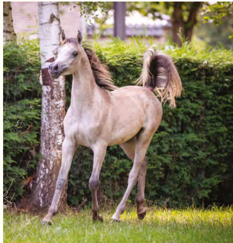
LA DIVA KALIL (Al Ghazi Al Rashediah x El La Diva Nile-la)