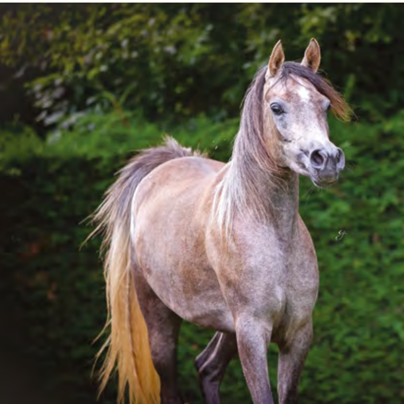
AL QUSAR MADIBA (NK Nizam x Masara Al Qusar)

possible in breeding. It is more important to create a typey overall picture than to breed only extreme heads with long necks. In addition, the loving and