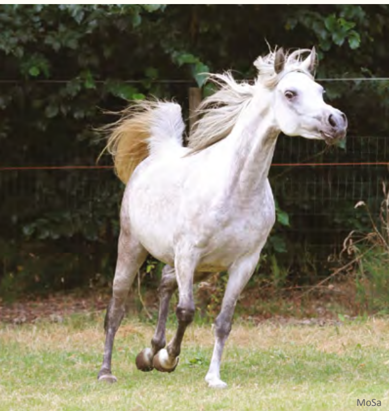
LA DIVA NILE-LA (Ansata Nile Echo x CD Anasta)