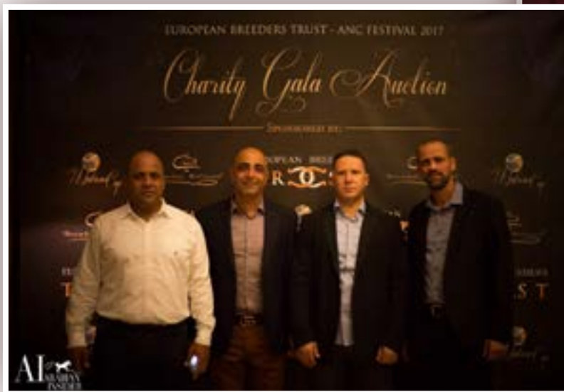
EBT Charity Gala Dinner with friends