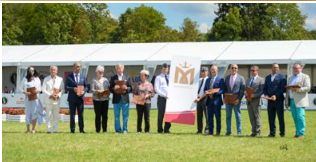
Eiad judging National Championship- Poland