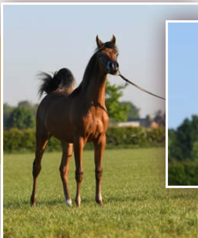
Yearling filly- RDS Teodora (Fa el Rasheem x Tai mi Lena)

For centuries the Arabian breed has been a family to the humans being taken care of and giving them a home created the Arabian to give their loyalty in return. There is so much more to tell about these incredible creatures. The most fascinating part about them is the pure heart they have and the mind which is willing to work hard for only care and friendship in return..