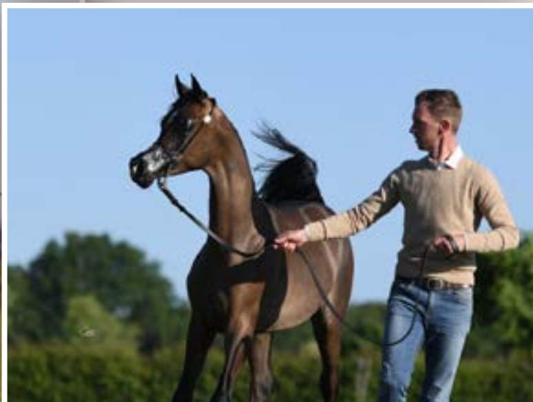
Yearling colt- RDS Armani (Excalibur EA x Stellaris BPA)