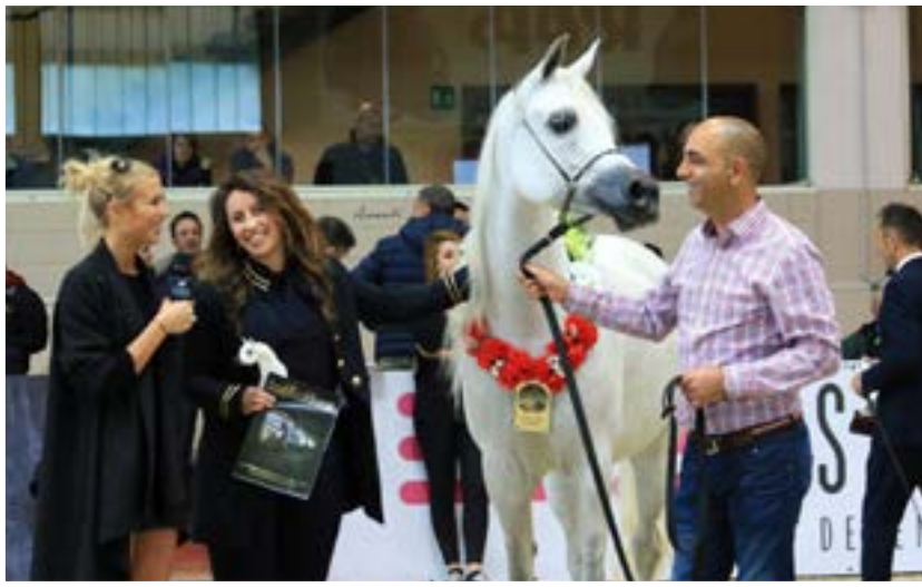
Nesj El Markhisa Gold - B- international Show Milan