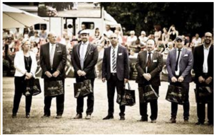
Eiad Judging Brugge International Show