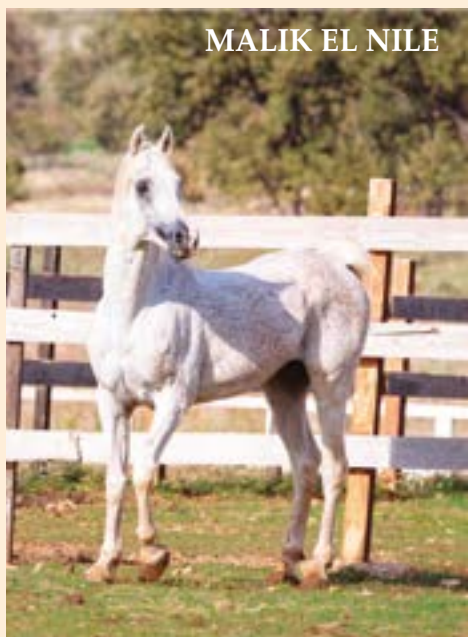
MALIK EL NILE