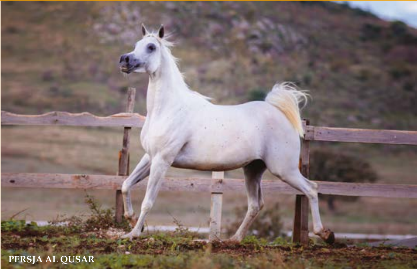
PERSJA AL QUSAR