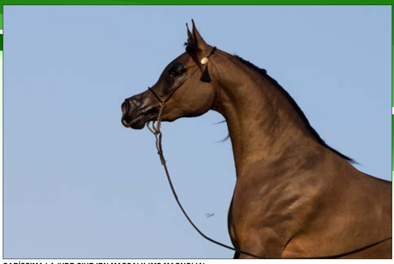
CARÍSSIMA LA (HDB SIHR IBN MASSAI X *MS MAGNOLIA)