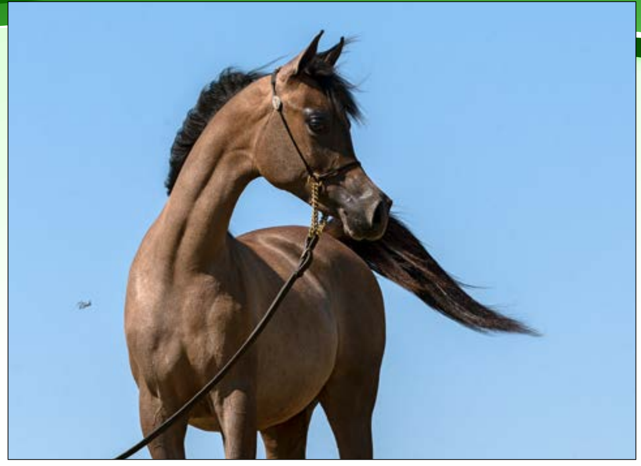
IRINA LA - EMARWA MEIA LUA (MARWAN AL SHAQAB)

by HDB Sihr Ibn Massai and out of DA Vincis Jewel, a classy chestnut mare who became Brazilian National Champion in 2018.