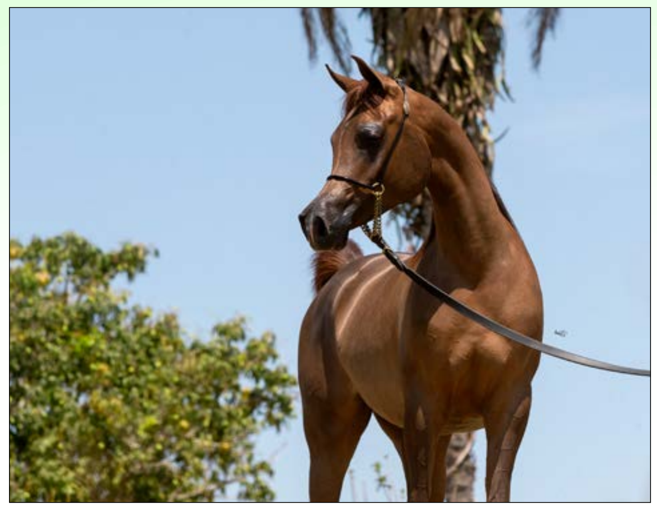
HORTENCIA LA - MS MAGNOLIA (MARWAN AL SHAQAB)