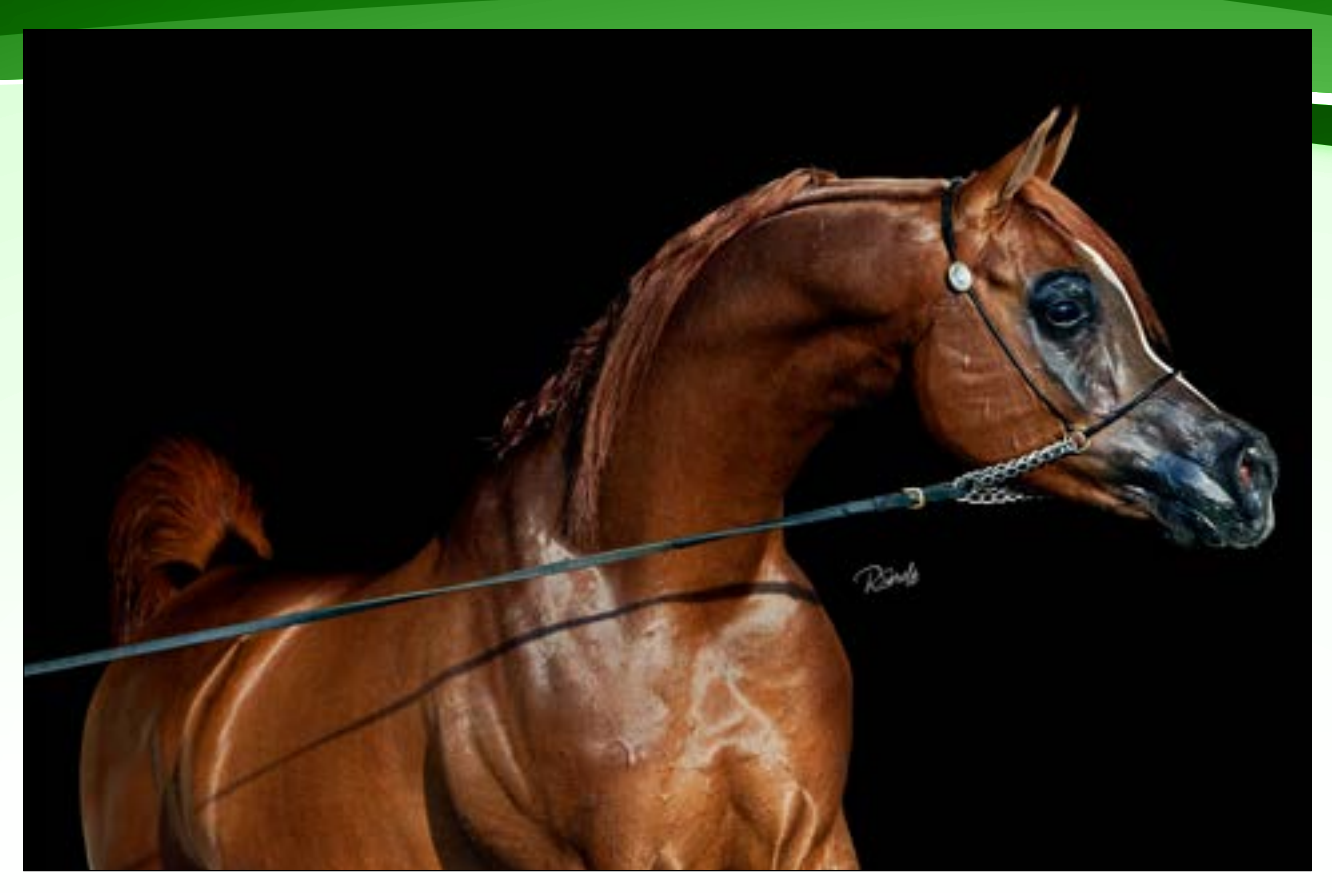
HDB SIHR IBN MASSAI (MASSAI IBN MARENGA X MAYANA). 2-TIME BRAZILIAN NATIONAL CHAMPION