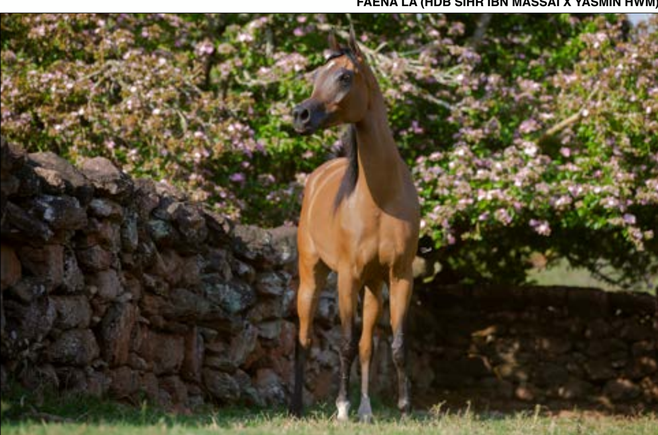
FAENA LA (HDB SIHR IBN MASSAI X YASMIN HWM)