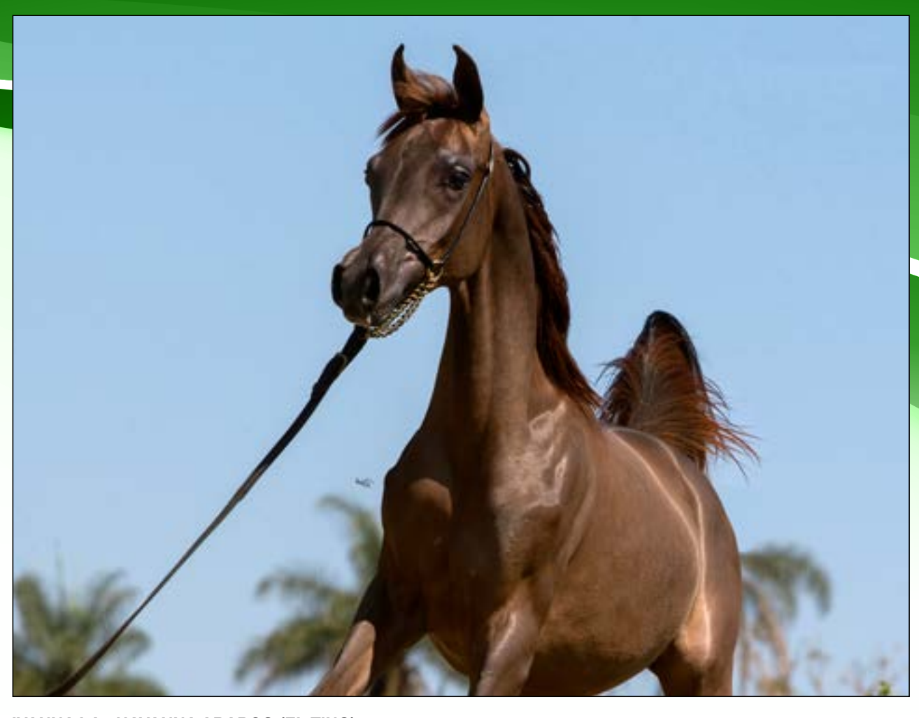
IVANNA LA - HAVANNA ARABCO (EL TINO)

you finally manage to breed such an incredible animal as Flora, you wish to keep her forever in the barn next to your office and you wish to use her in your breeding programme. However, as I have already mentioned, all breeders have an enormous responsibility for the future of the breed. At that point in time, letting her go was the right thing to do, considering all the new possibilities for her with the new owners.