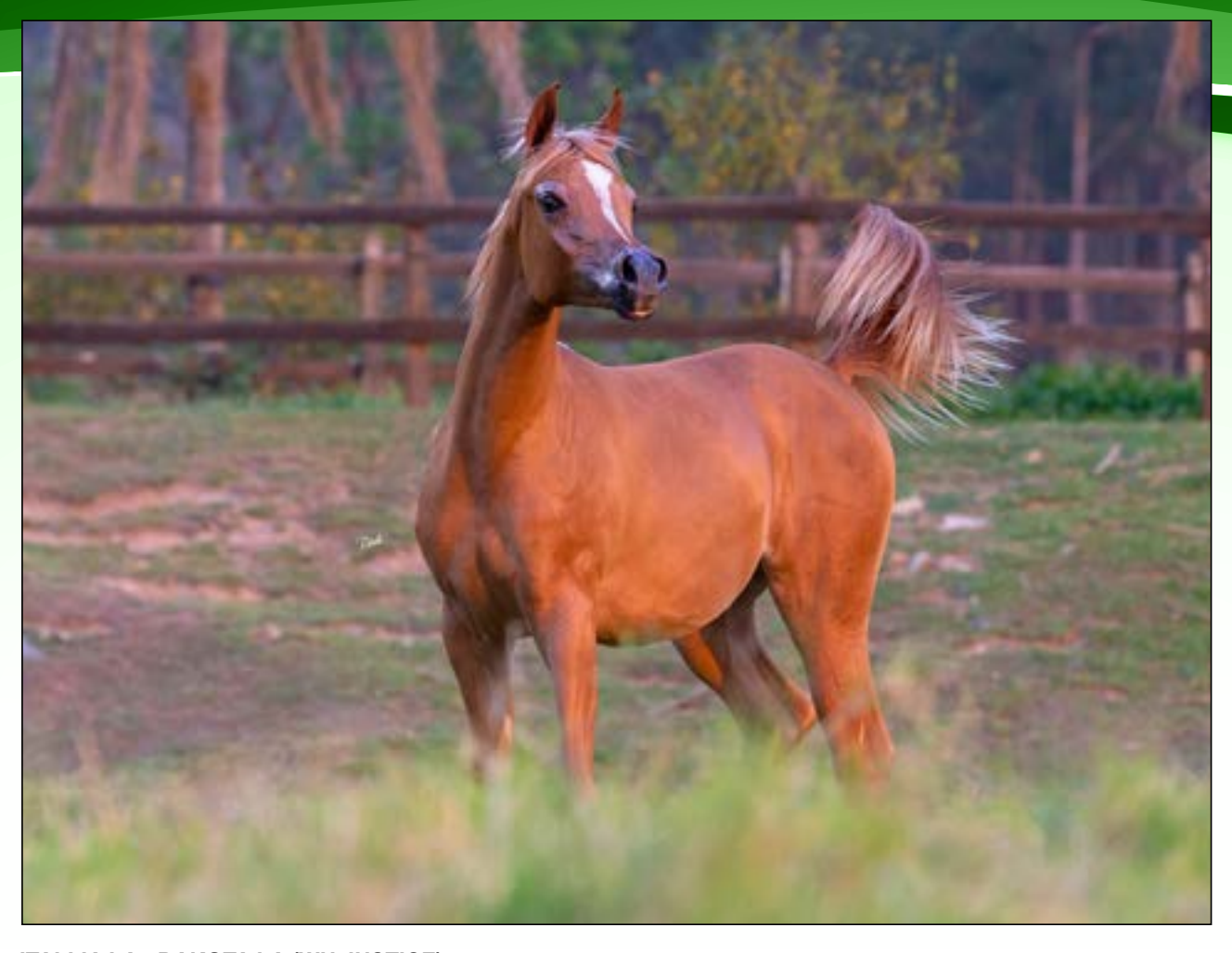
ITALLIA LA - DAKOTA LA (WH JUSTICE)

mix. Genetically, he is very different to the majority of bloodlines we have here, which means that there are plenty of opportunities for him to be crossed with a lot of our mares. He has already contributed greatly to our breeding program.