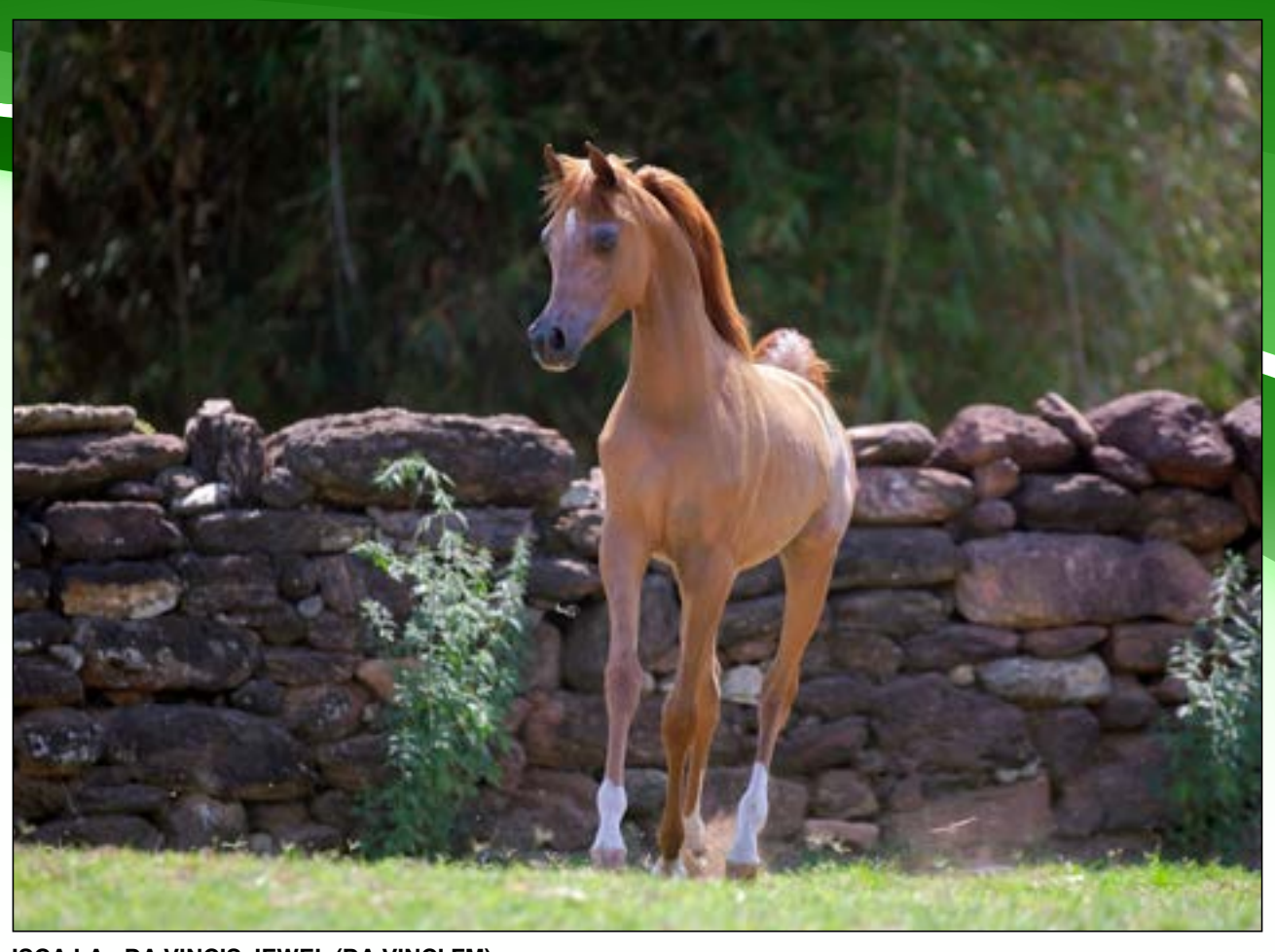
ISCA LA - DA VINCIS JEWEL (DA VINCI FM)