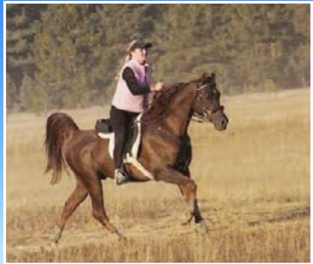
That also Arabians with a showhorse pedigree can perform, proofs this picture, showing Om el Bernini Dream (SMF Dreamcatcher x Om el Benedict by Sanadik el Shaklan) winning the Calero Classic in 2010.