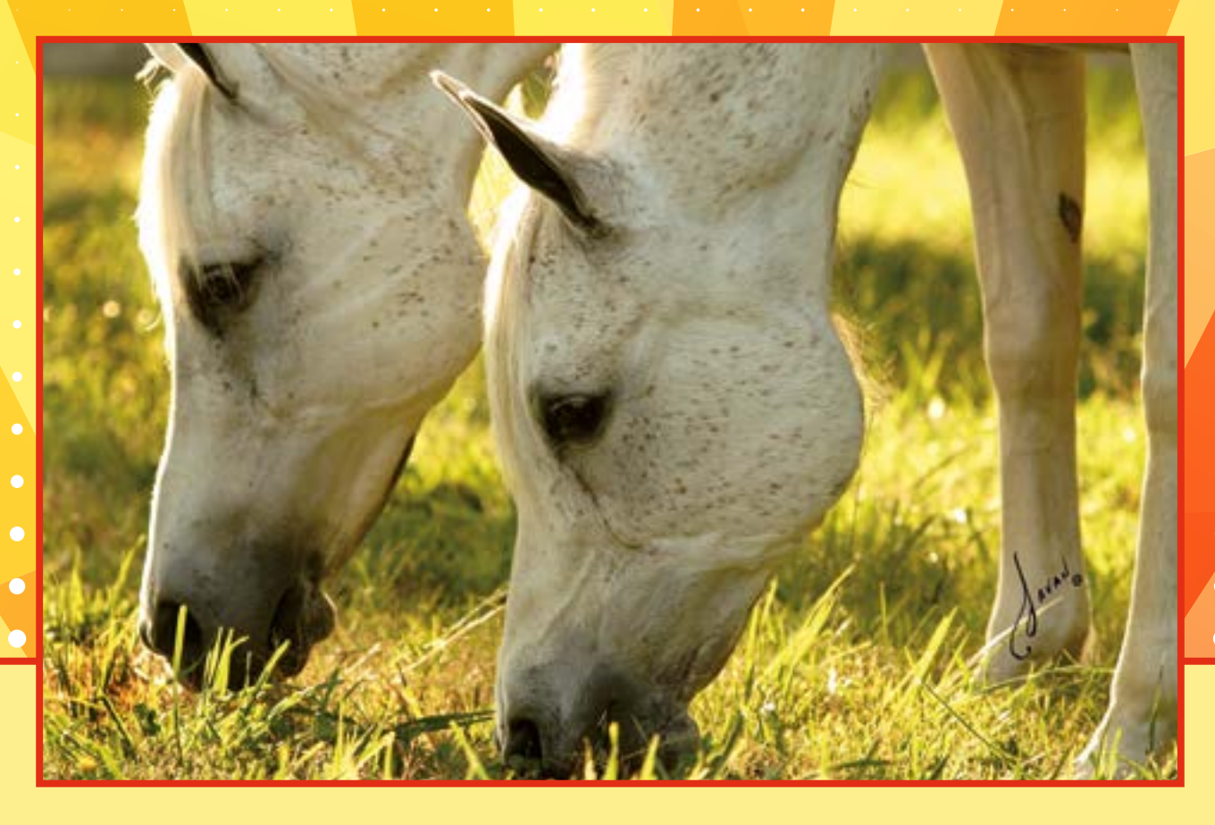
full intake, it might make the liver work excessively or, in the worst cases, lead to fully-fledged diseases.